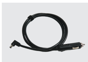
DC POWER CORD