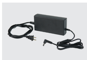
AC POWER SUPPLY (ALL CORDS INCLUDED)