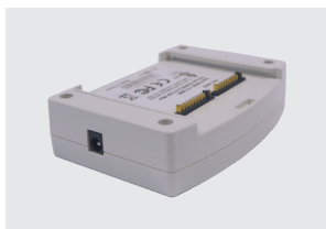
DESKTOP BATTERY PACK CHARGER (OPTIONAL)