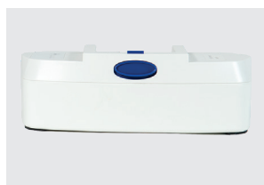
16-CELL BATTERY PACK