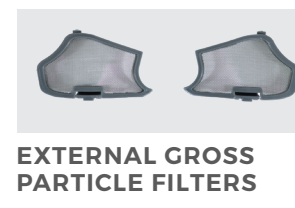
EXTERNAL GROSS PARTICLE FILTERS